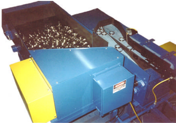
Race Bearing Feeder System Shown with Indexing Storage Unit