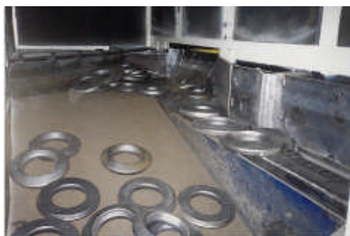
Ring Gear (35 Pound) Feeder System