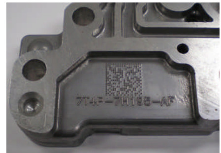
Example Mark Shown