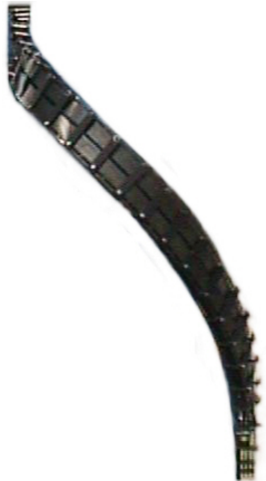
180-Degree Curved, Ride Rail Track Shown

Storage provides continued through put operation