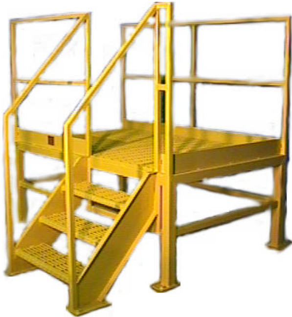
Machine Loading Platform Shown